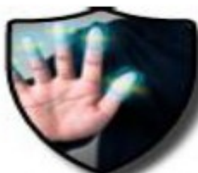
FINGER PRINT READERS