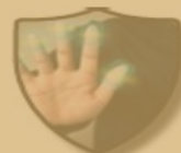
FINGER PRINT READERS